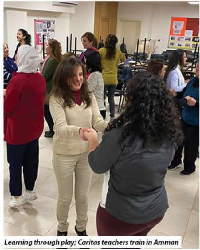
Learning through play; Caritas teachers train in Amman

Children are encouraged to express themselves through 'natural languages', including drawing, painting, working in clay, sculpting, constructing, conversing, and dramatic play. Educators pay close attention to the look and feel of the classroom to create a room that is beautiful, joyful, inviting and stimulating.