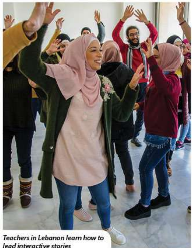
Teachers in Lebanon learn how to lead interactive stories