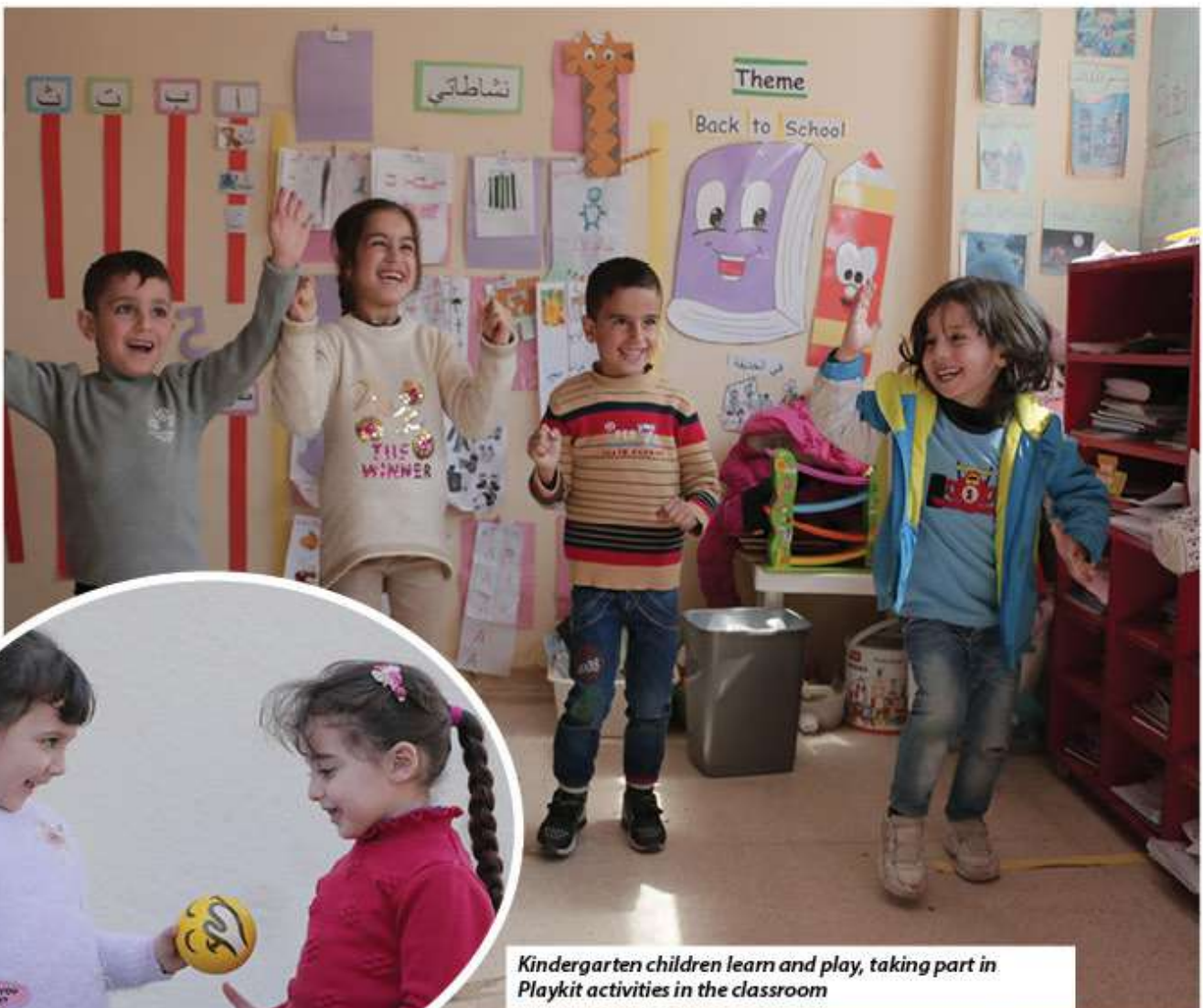
Kindergarten children learn and play, taking part in Playkit activities in the classroom