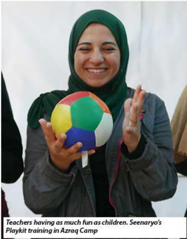
Teachers having as much fun as children. Seenaryo's Playkit training in Azraq Camp